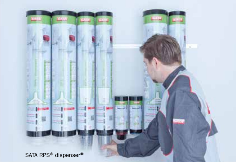
SATA RPS® dispenser®