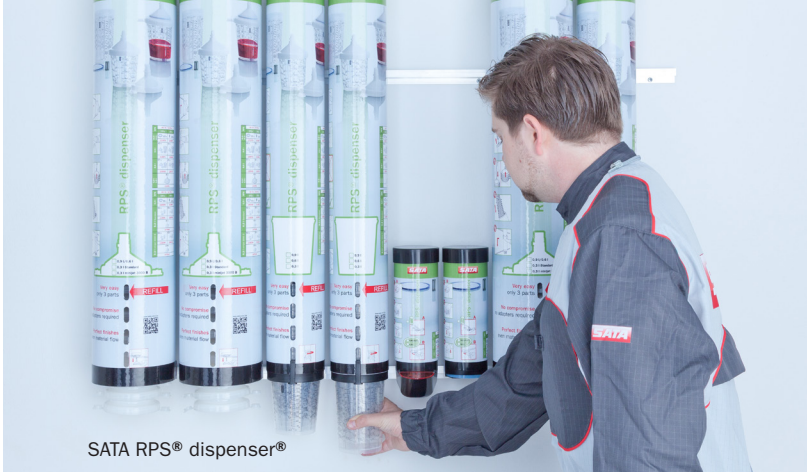
SATA RPS® dispenser®