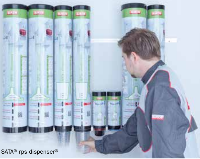
SATA® rps dispenser®